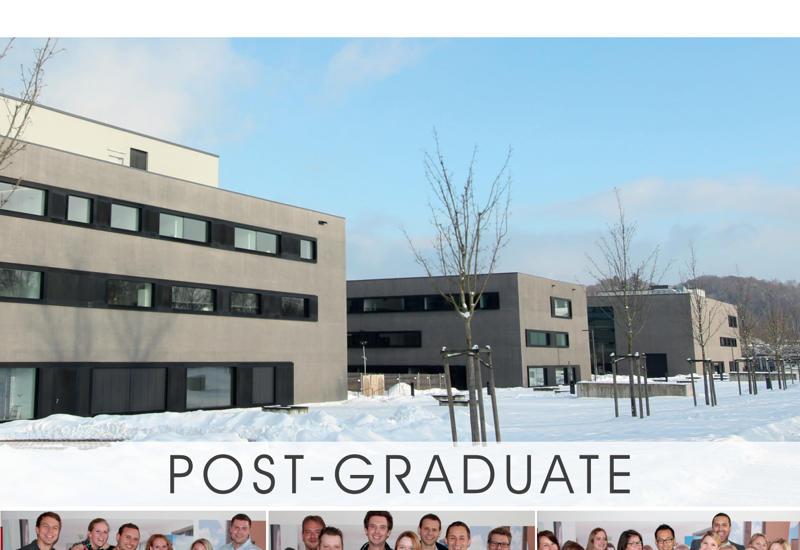
THE ONLINE MAGAZINE FOR DEGGENDORF ALUMNI